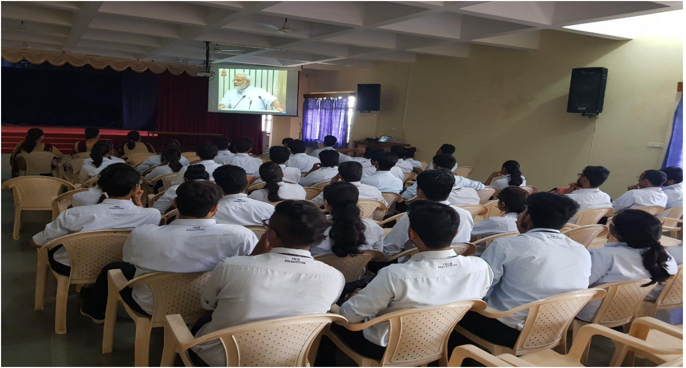
Address to Youth of India by Hon'ble PM Shri. Narendra Modiji