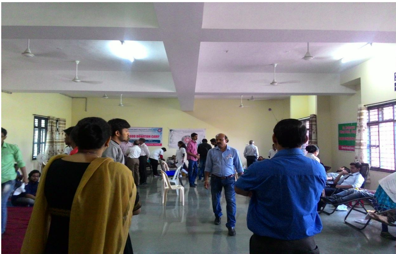
View during Blood Donation Camp