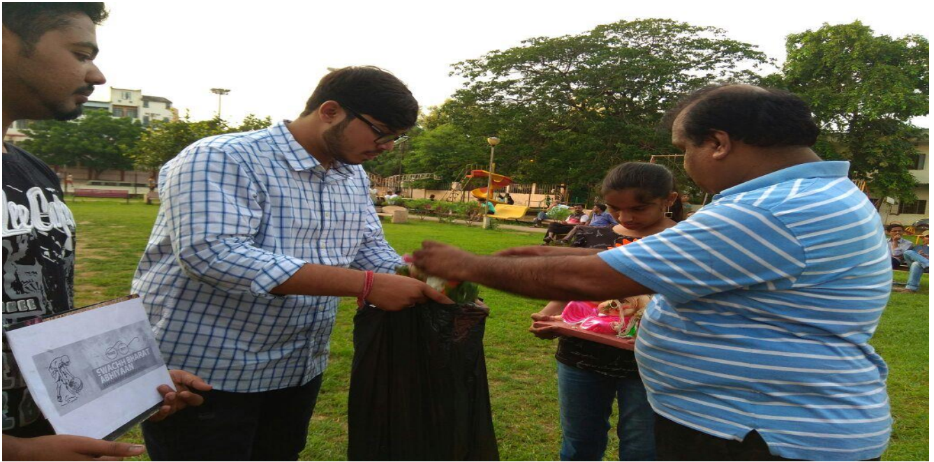
NSS Volunteers helping residents to collect Nirmalya during Immersion