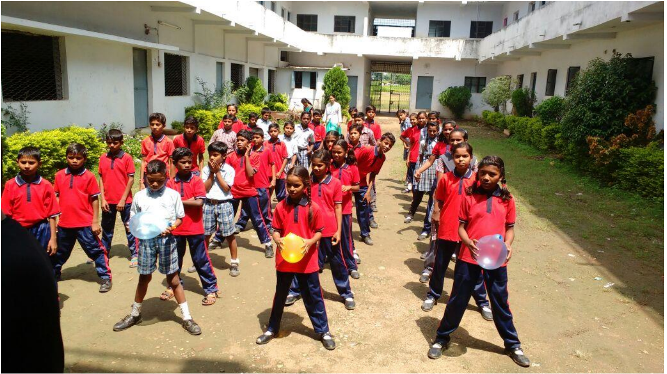
School Students engaged in playing Fun Games