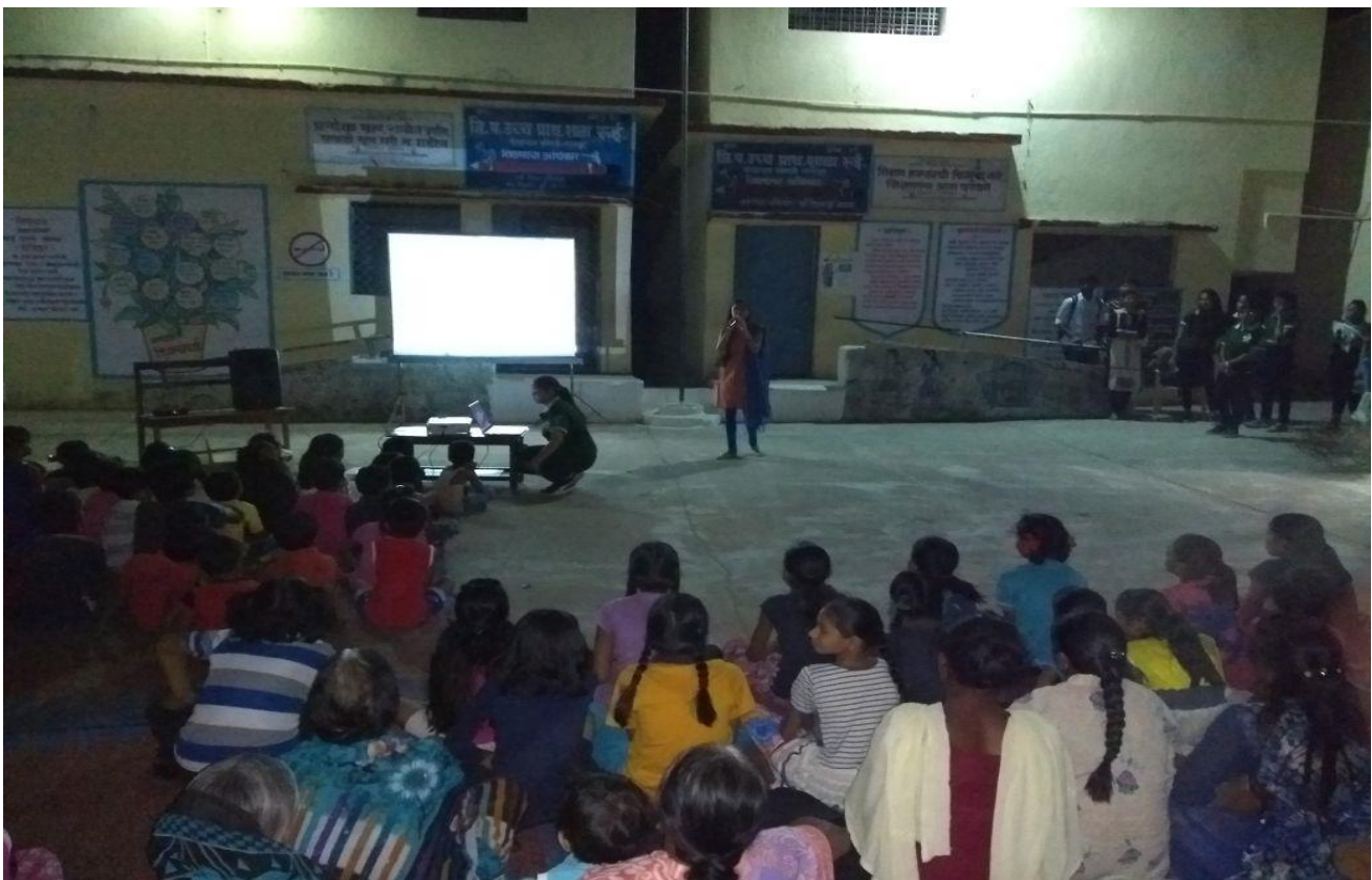
Student Volunteer Explaining Importance of Swachchata through a Video Presentation