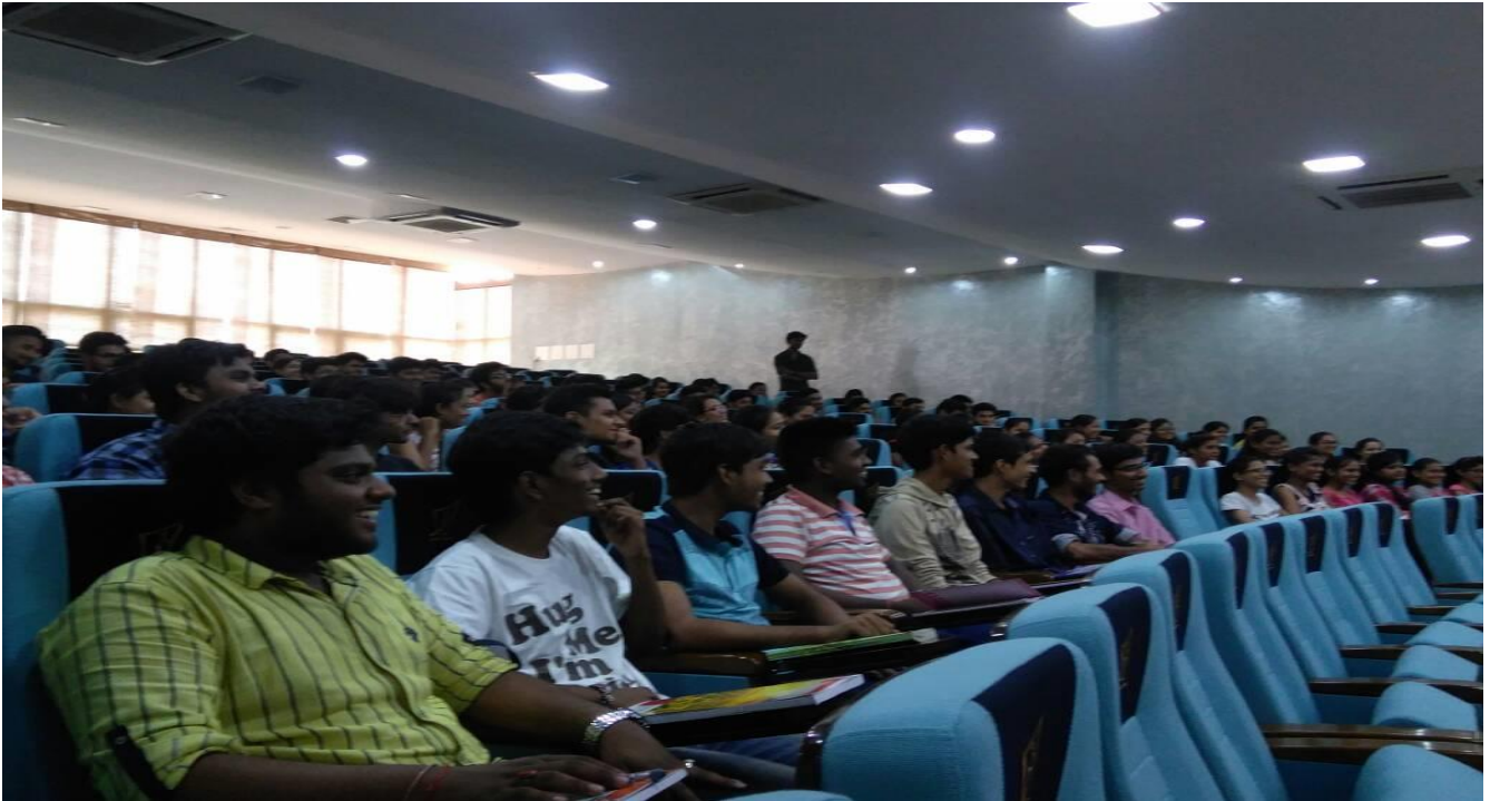
Faculty & Student Volunteer Participants