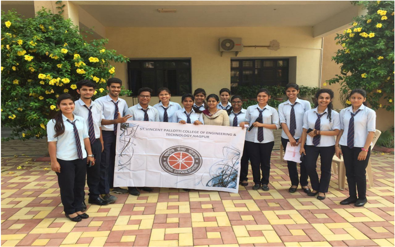
Members of Team along with Faculty Coordinator