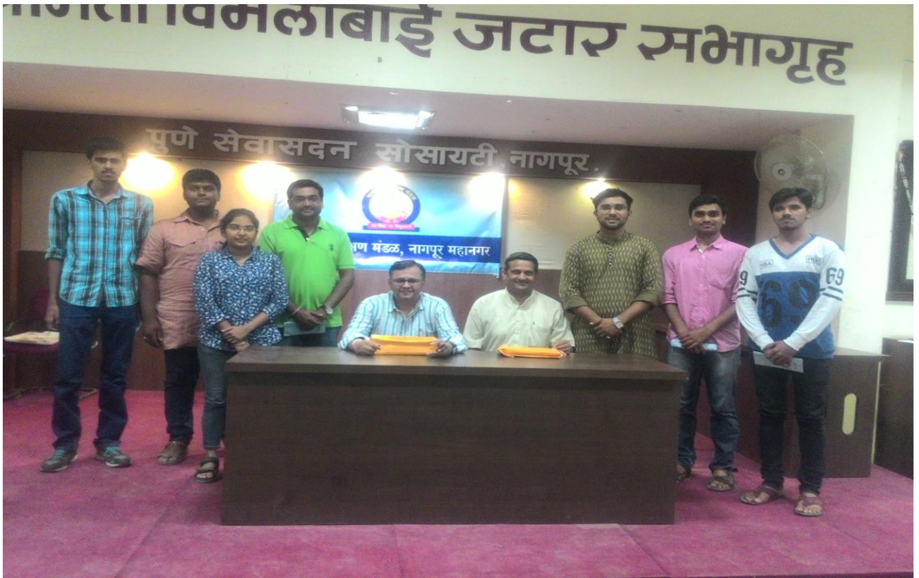
Faculty coordinator & Student Volunteer along with dignitaries