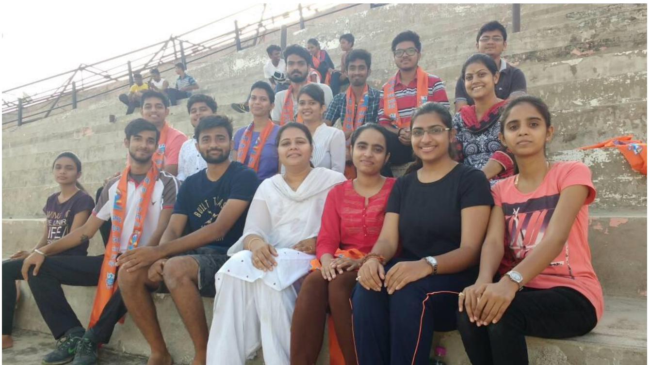
Faculty & Student Volunteer Participants