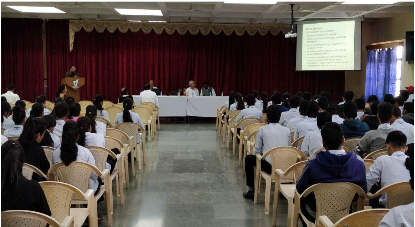
Student volunteers during the interactive session