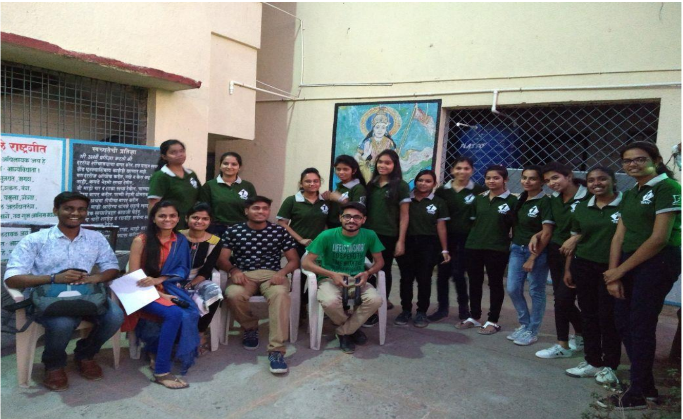
Team of Student Volunteers after the Program