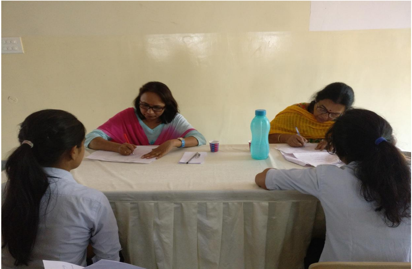
Team of Lady Doctors Examining Girl Students