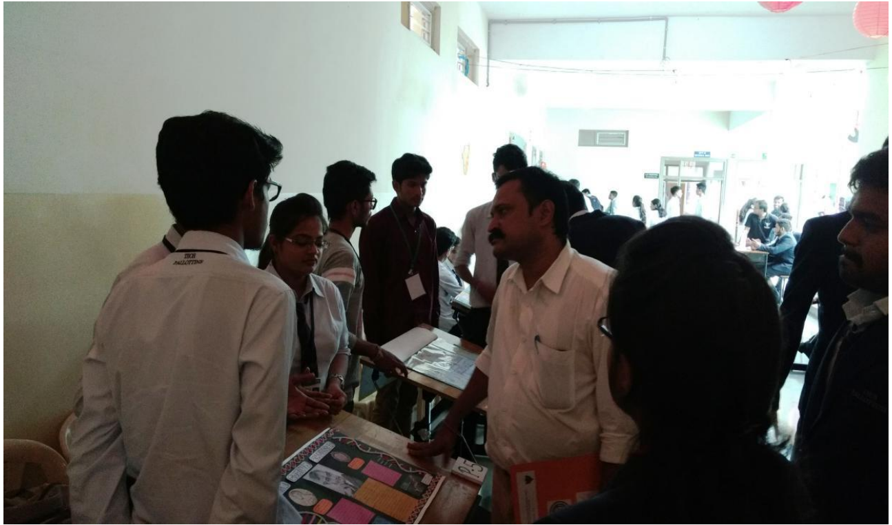
Event Judge Interacting with Participants