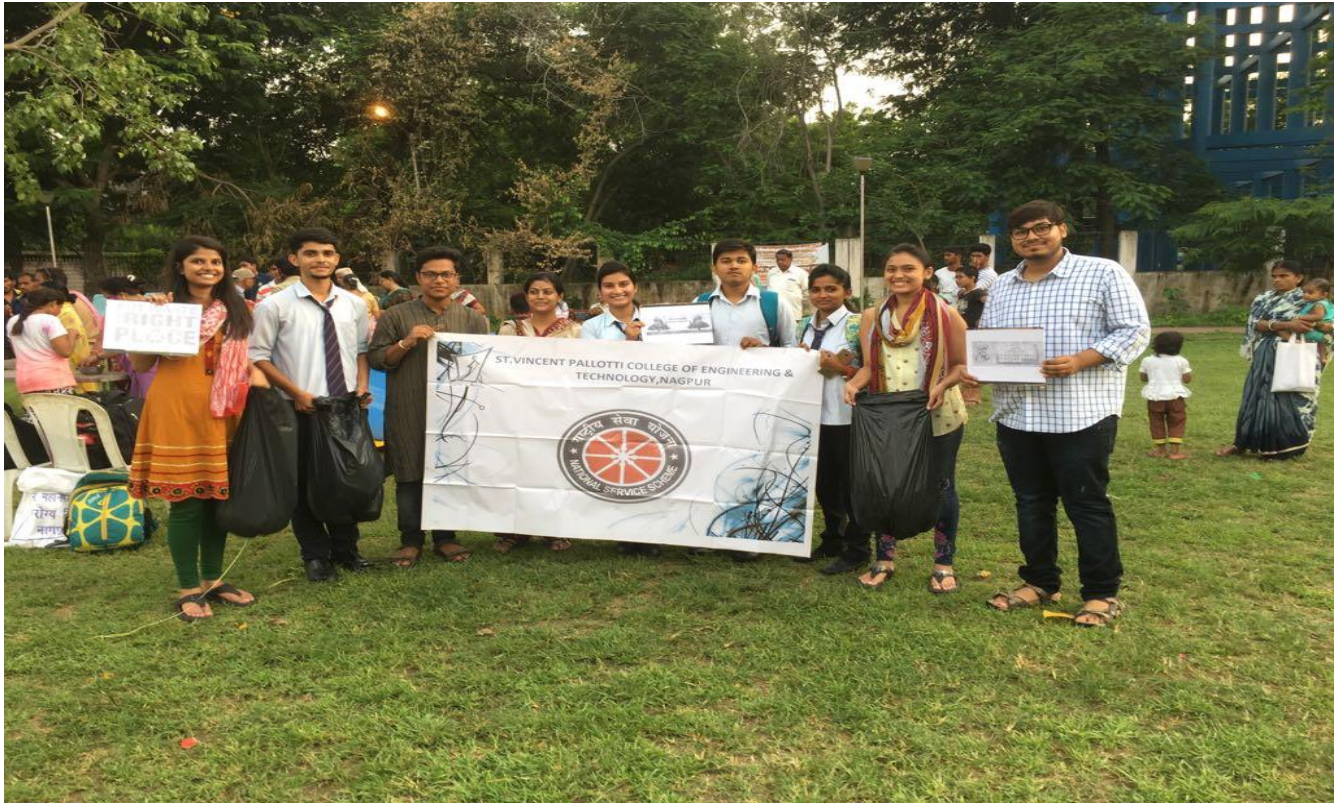
Staff & Student Volunteers during Immersion of Shri Ganesh Idol