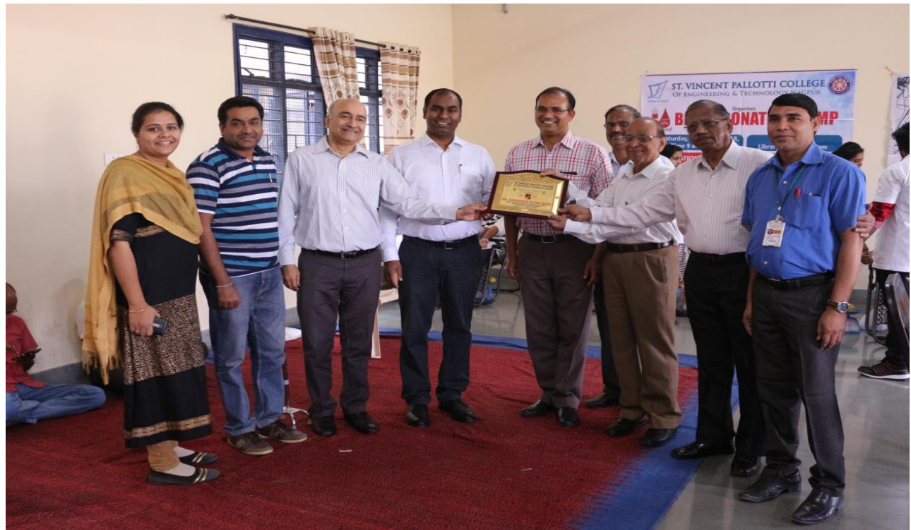
In-charge of Blood Bank Felicitating College Management for their support