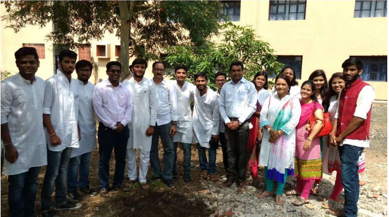
Staff members and Student Volunteers during Tree Plantation