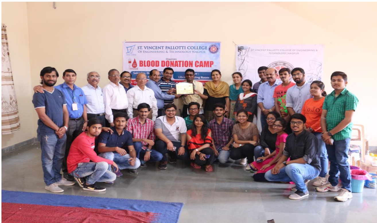
NSS team of Staff and Student Volunteers along with Blood Bank team