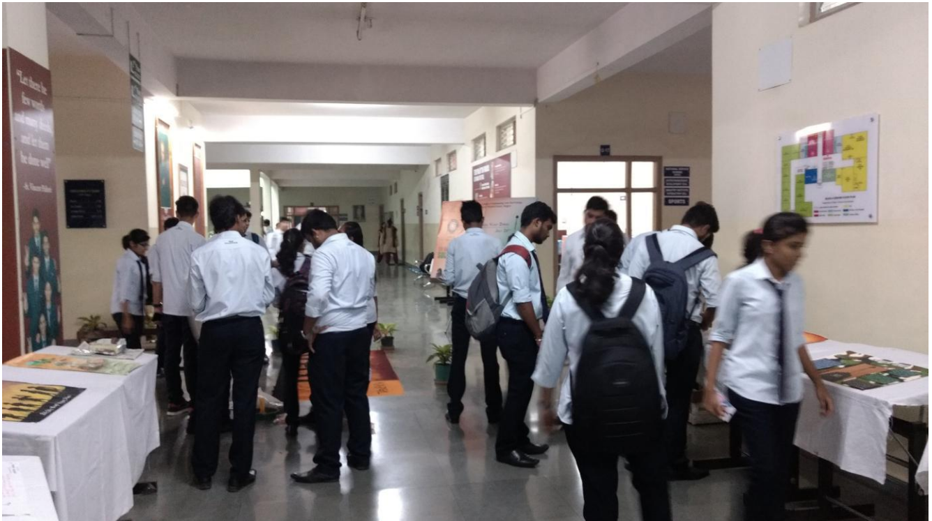
Exhibitors visiting Poster Display during Observance of Kargil Vijay Diwas