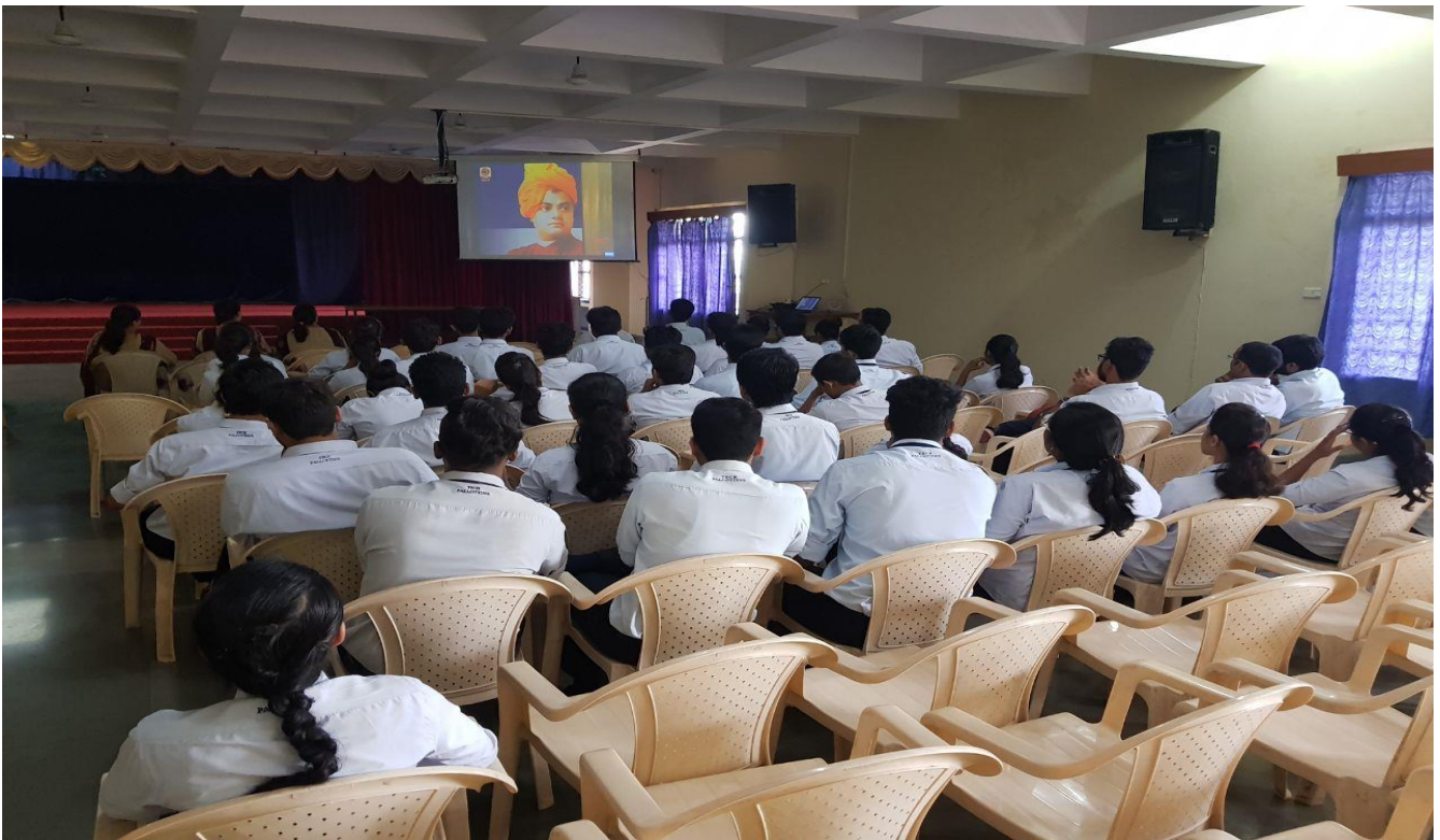
Student Volunteers and Faculty members listening to PM Address