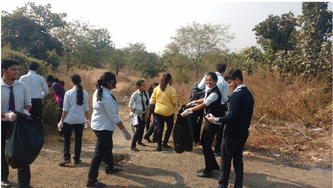
Student volunteers collecting garbage on college road