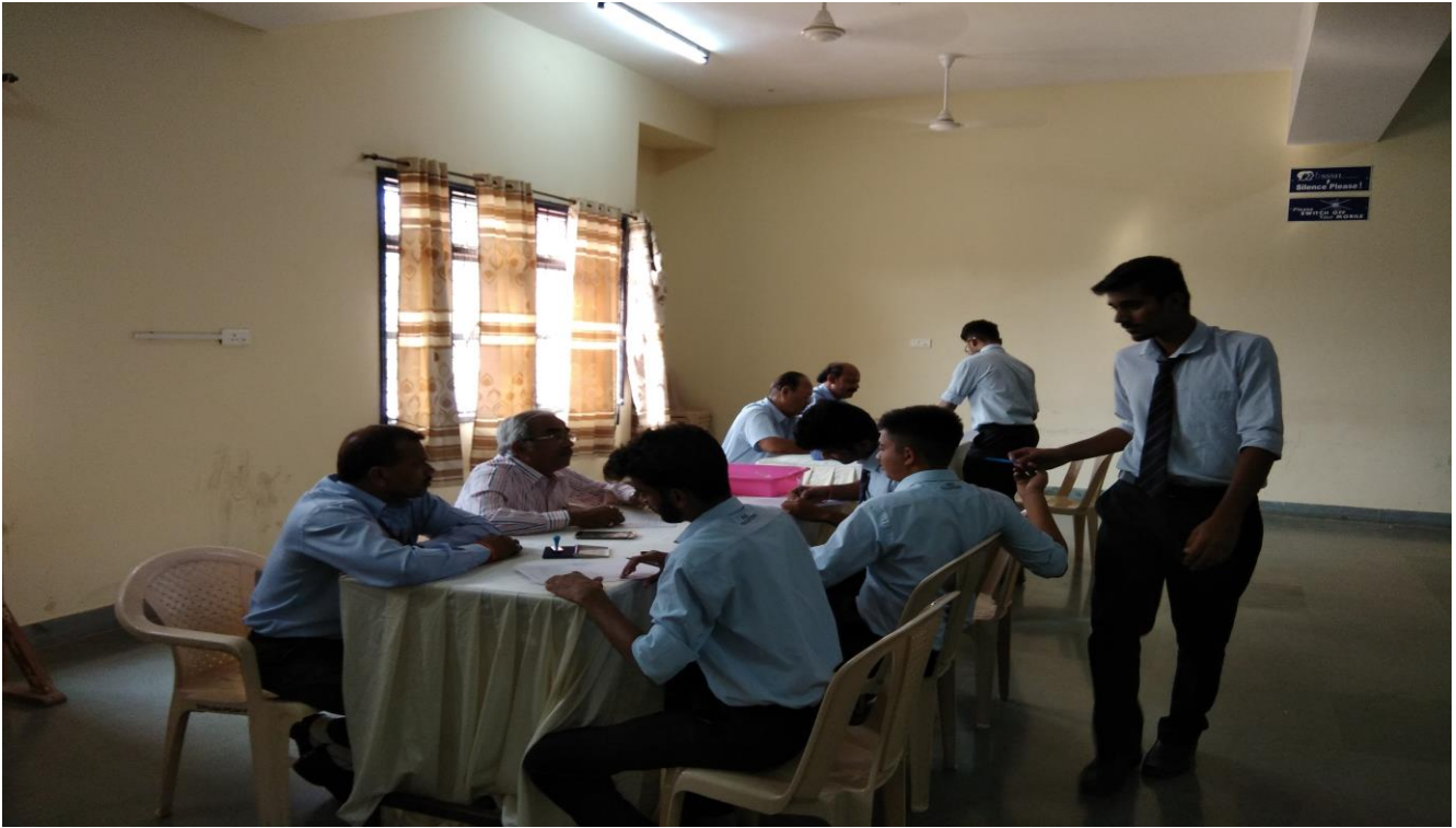
Team of Doctors Examining Boys Students