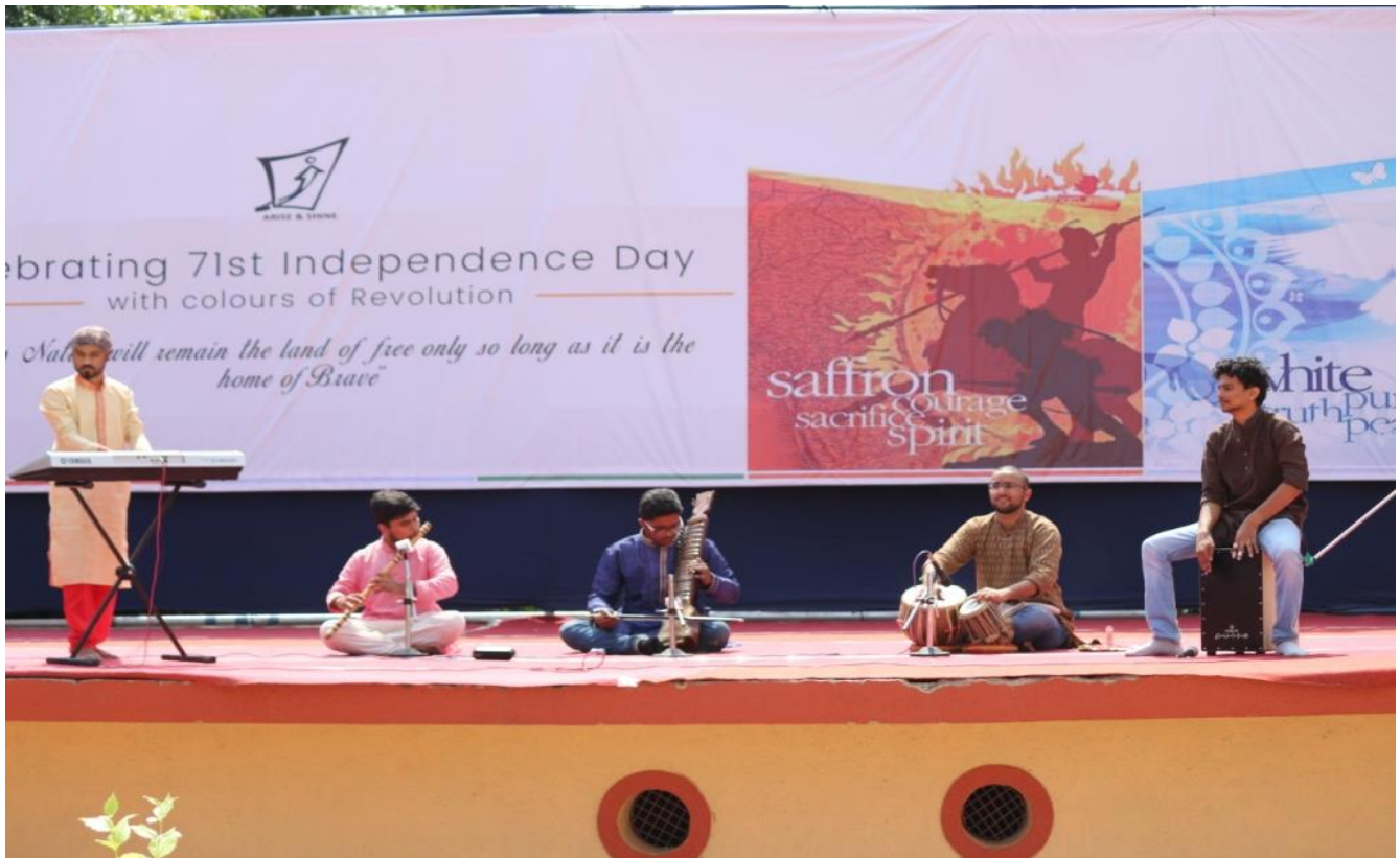
Musical Melody performance by Students during function