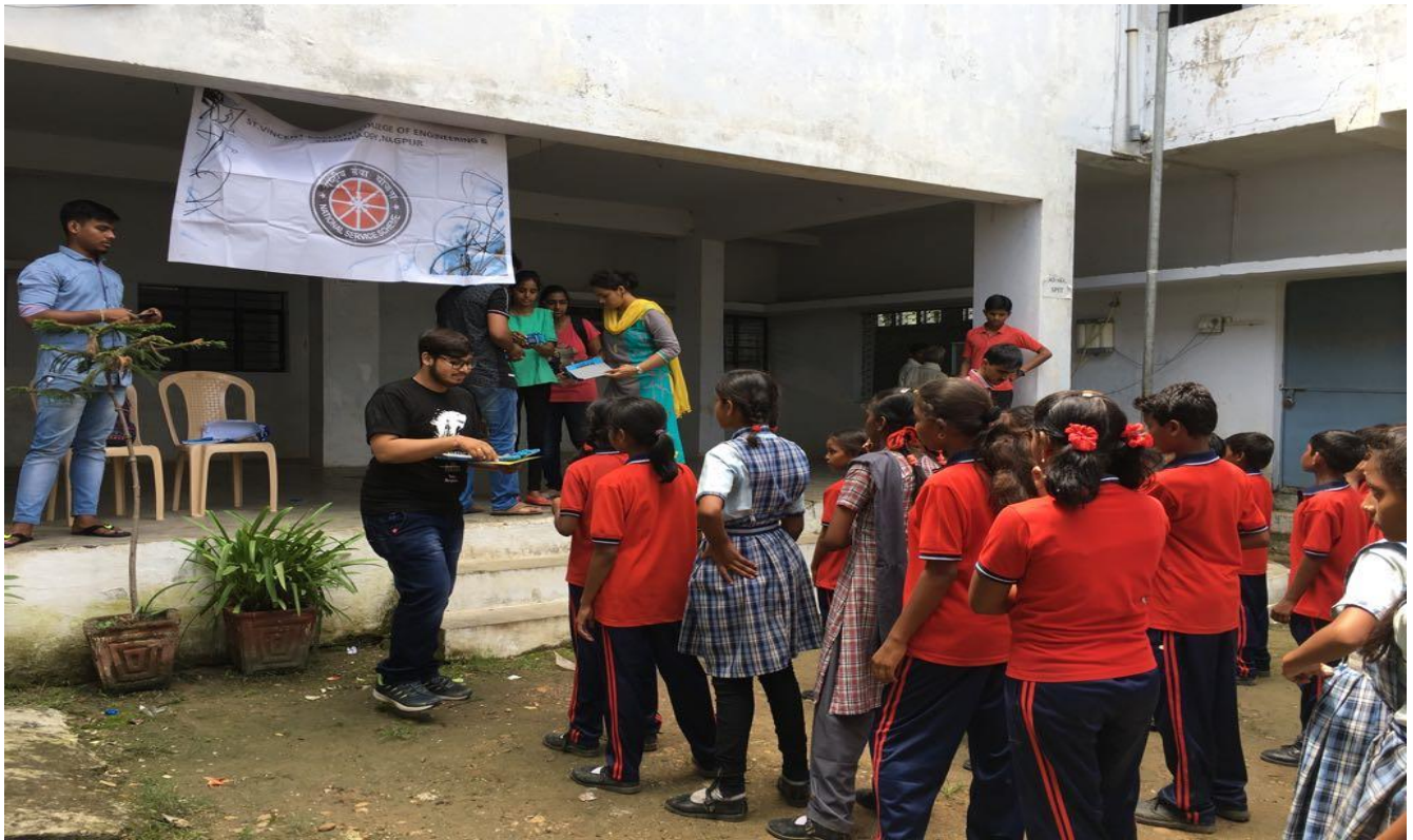
Student distributed with Gifts during visit