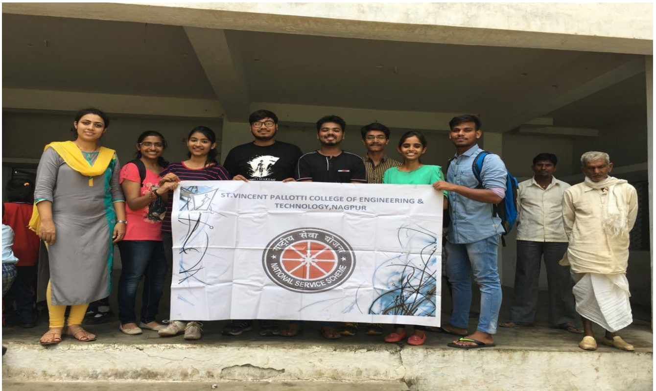
Staff Coordinator and student volunteers during visit