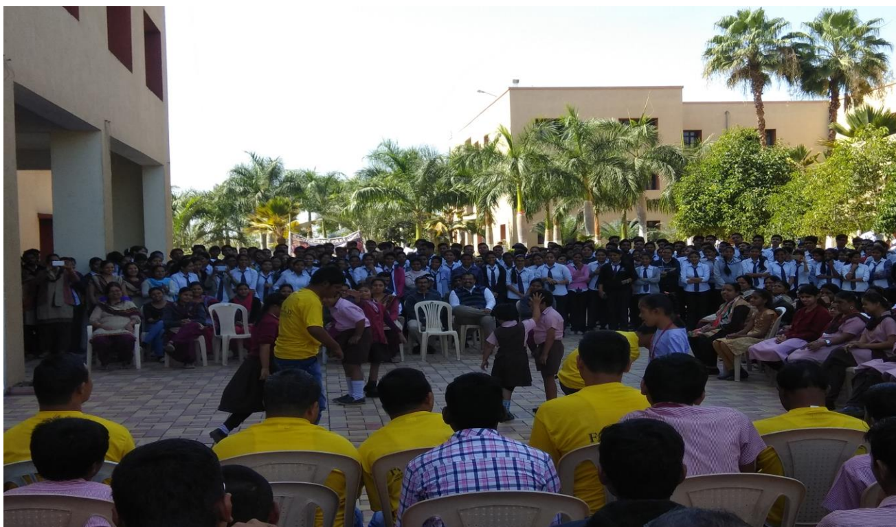
Special Guests from Jeevoday School performing in front of gathering