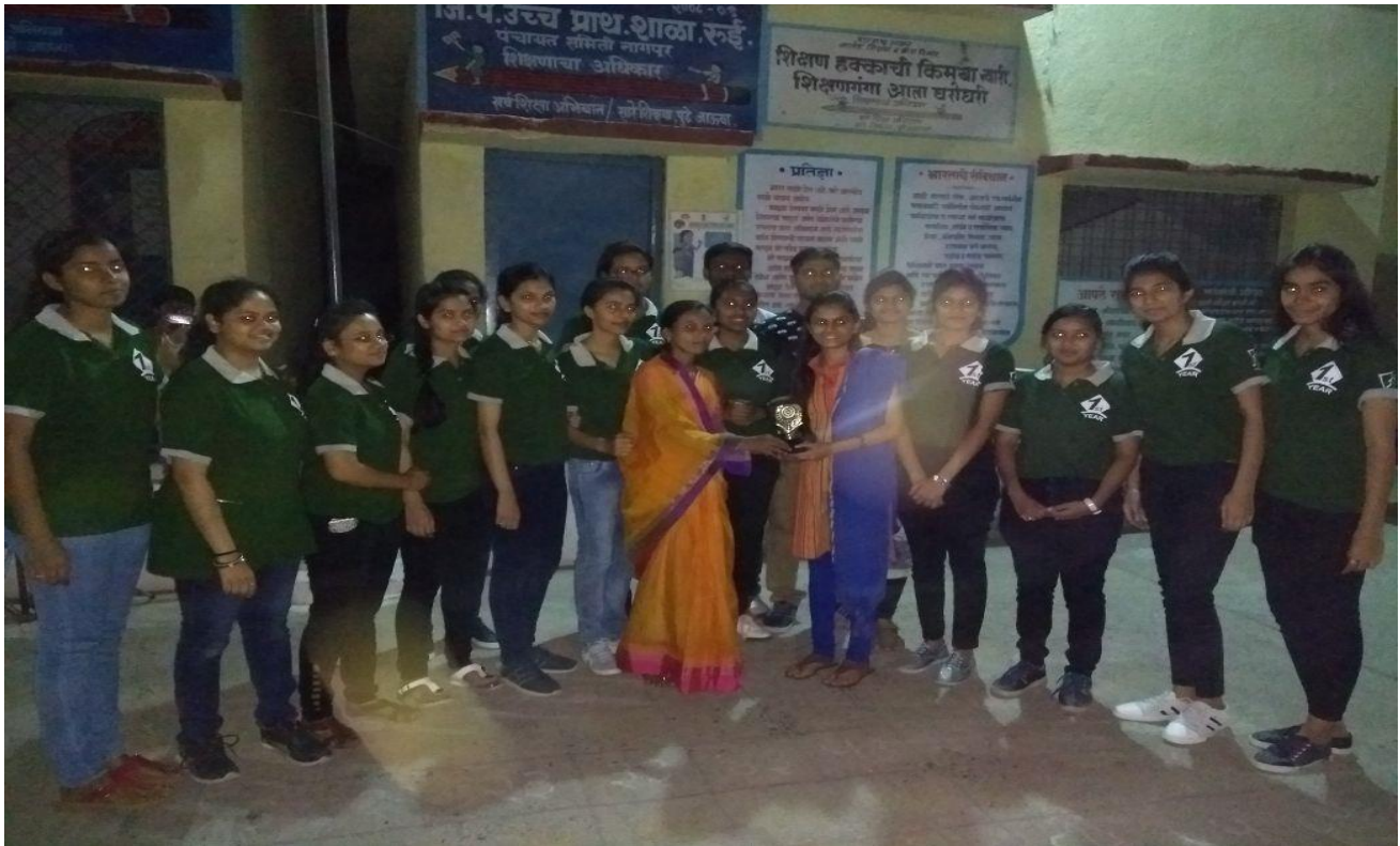
Student Volunteers of team felicitating Sarpanch of Rui Village