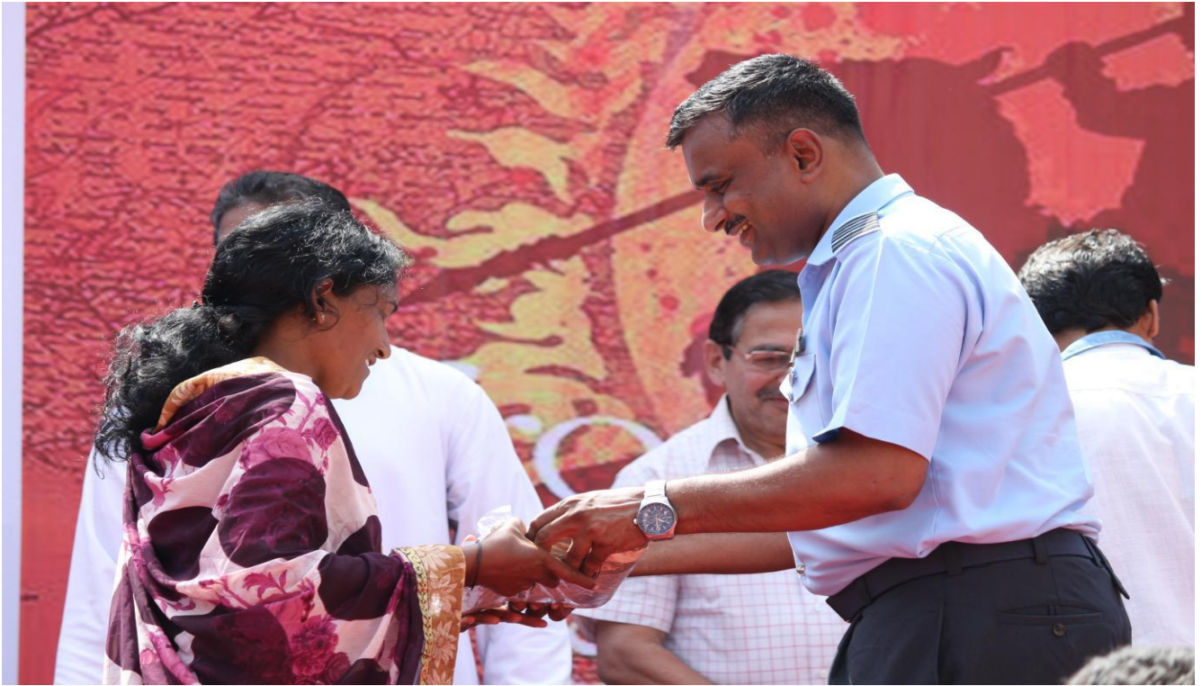
Housekeeping Staff being felicitated by the hands of Chief Guest