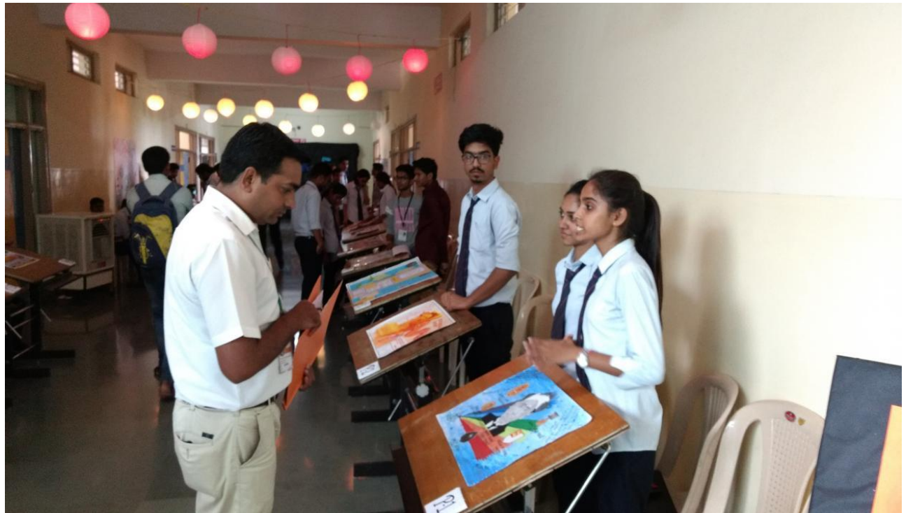
Posters being evaluated during competition