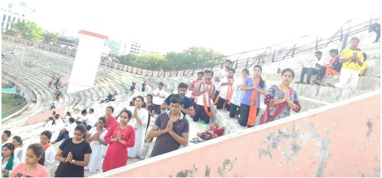
Yoga for Harmony & Peace