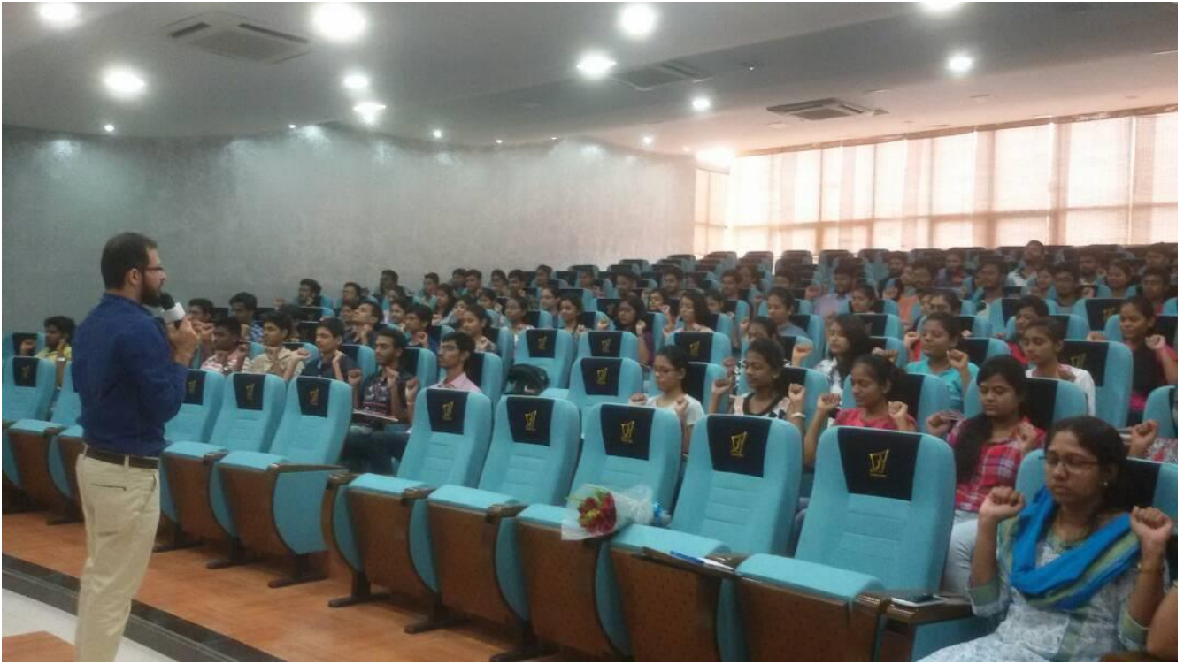
Participants performing Stress Management Exercise