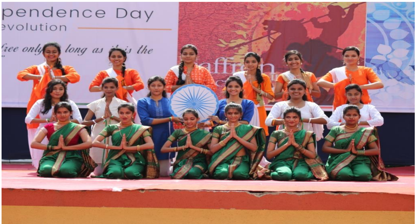
Cultural Performance by Students