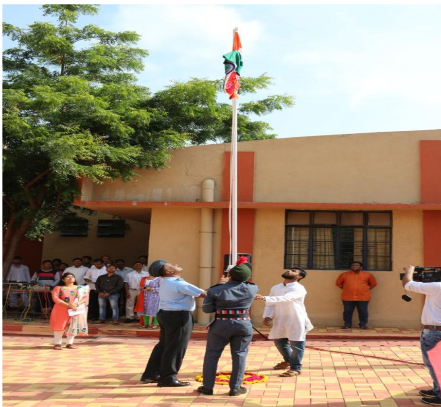
Flag Hoisting took Place by the hands of Chief Guest