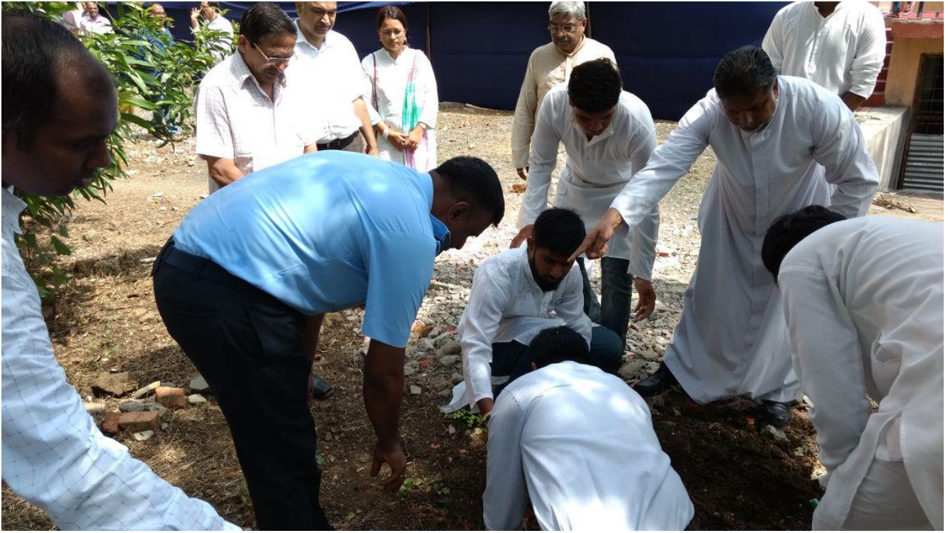
Chief Guest Wing Commander G L Nagendra Planting First Sapling during Tree Plantation