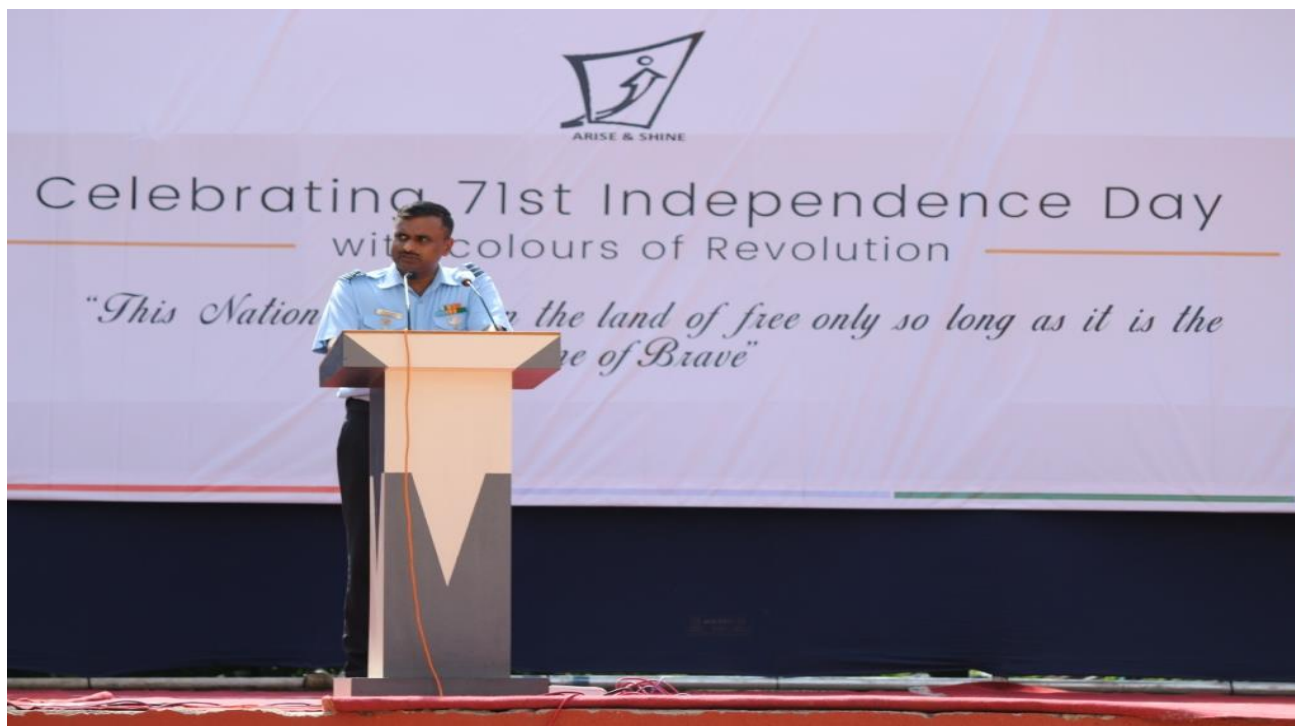
Address to gathering by Chief Guest