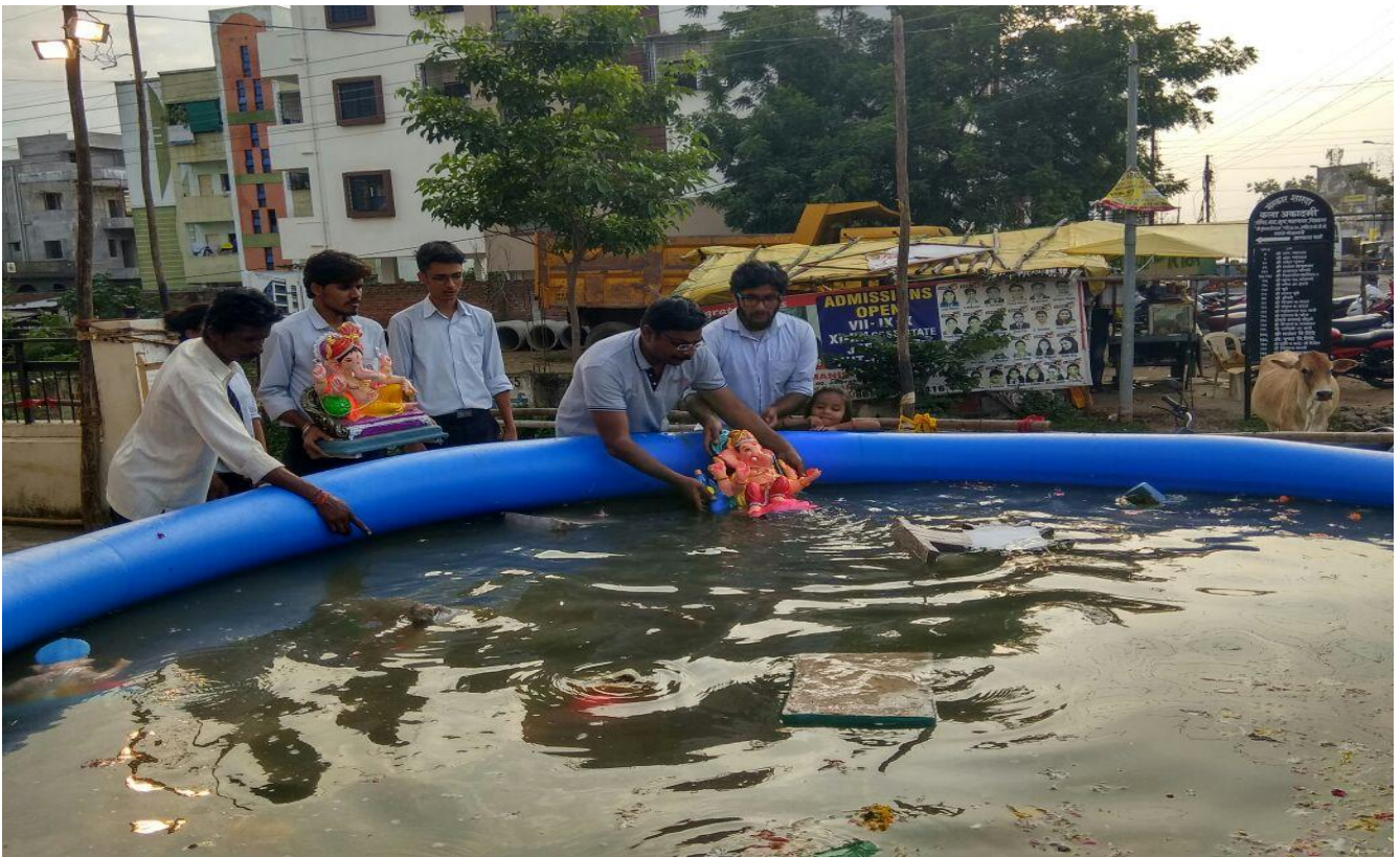
Immersion of Shri Ganesh Idol in an Artificial Water Tank