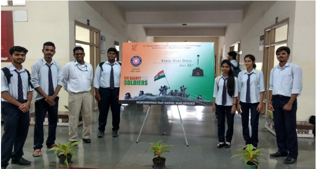
Faculty Coordinator and Student volunteers