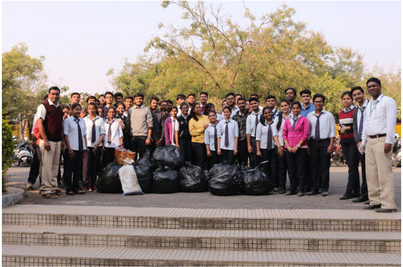
Staff Coordinators & Student volunteers after conducting cleanliness drive