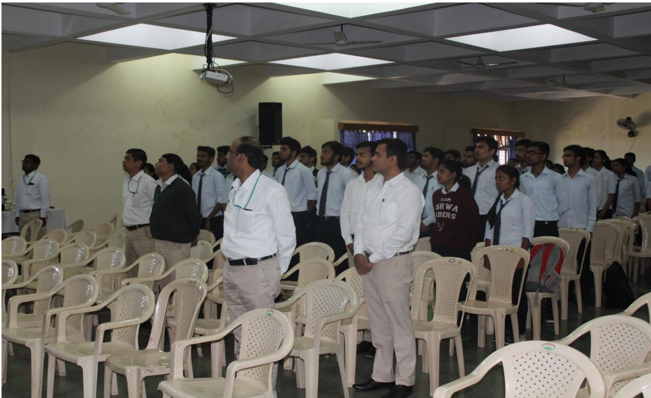
Staff and Student participants reciting Indian Constitution Preamble