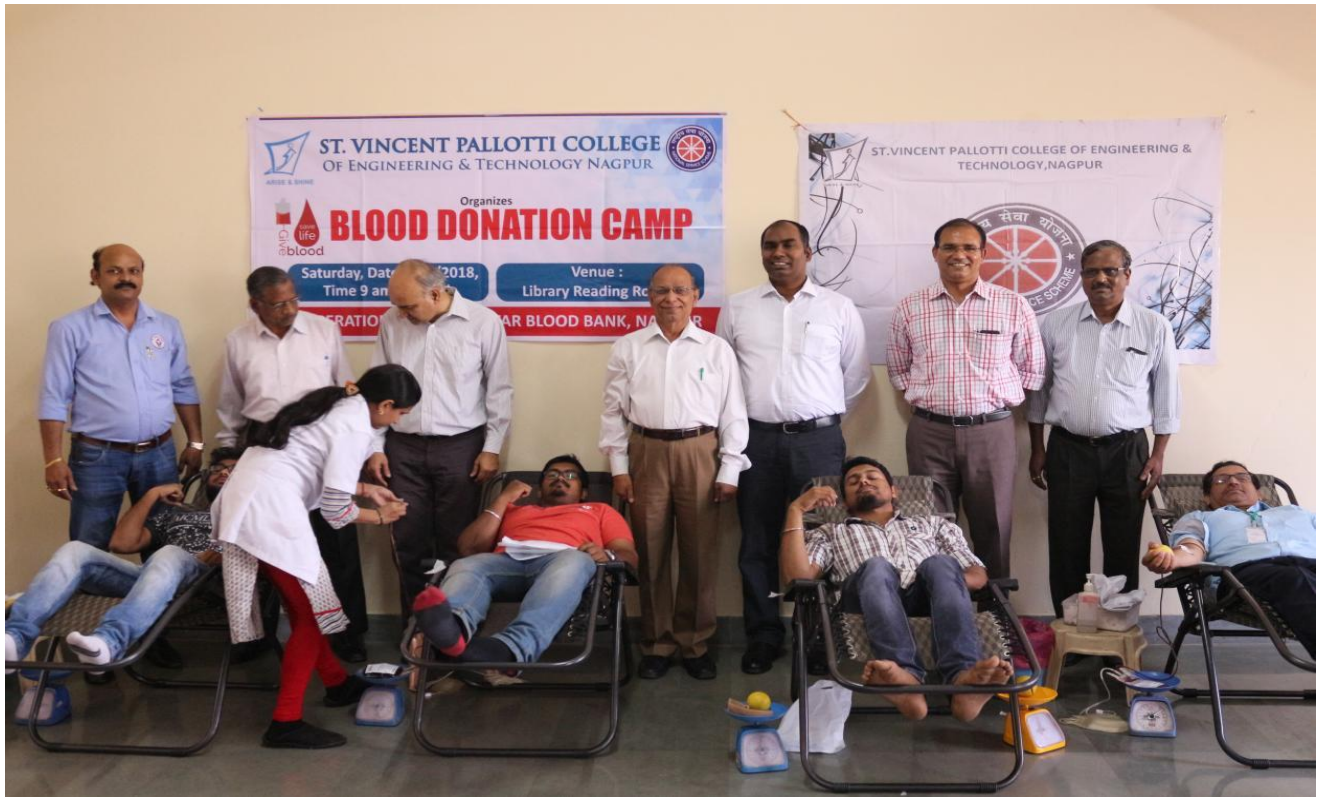
Dignitaries of College along with Dr. Hedgewar Blood Bank team during Blood Donation Camp